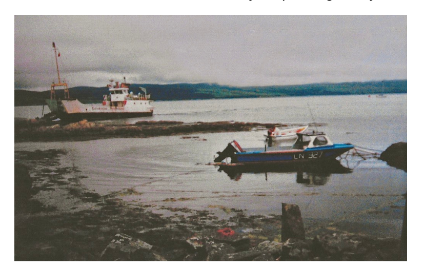
Before the roll on, roll off ferry, there was The Bruernish.